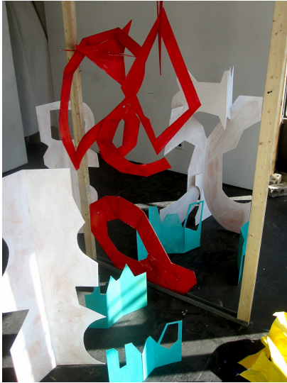
Details: scenographic installation for opera from "Ibex [ Diagrams for an Empty Stage]", 2015-2012. Variable Dimensions, oil paint, museum board, wood.

When you start thinking about a project, how do you know what it's going to involve? Is it an art piece? An opera? A series of songs?