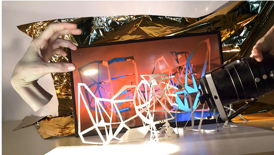
Details: production collage, Directory of Portrayals (from Rendering What Remains) 01, 2017. 25x39" Credit: © Sahra Motalebi, Courtesy of the Artist

When you're working on these multifaceted projects, if something's not working, are you willing to just let it go or do you try to keep it going?