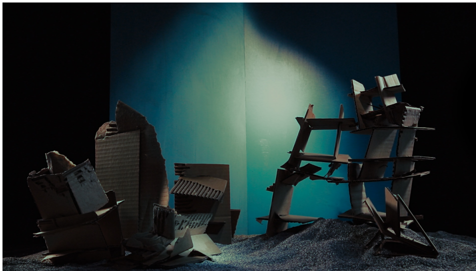
still from scenographic video, scene 4, "Sounds from Untitled Skies" 2015. Opera, 1 hour. Credit: © Sahra Motalebi, Courtesy of the Artist

There are weeks between projects that I don't do anything. People are like, "Are you singing a lot these days?" "No." But in general, I'd say I do very well under duress. My voice sounds better when I'm dehydrated and tired. So, burn out is actually ok when it happens. That's why I live upstate; it's a tank and a vacuum where I could go in for several weeks—get up at six, lunchtime, dinnertime, same time every day. It's a little bit like a convent. Go to sleep at nine. An amazing amount can happen in three weeks, maybe a year's worth of work. Especially when you're crunching numbers on things in the background of your mind, and you also have the chance to rest between projects—stack wood, walk outside—and you're sort of out there alone.