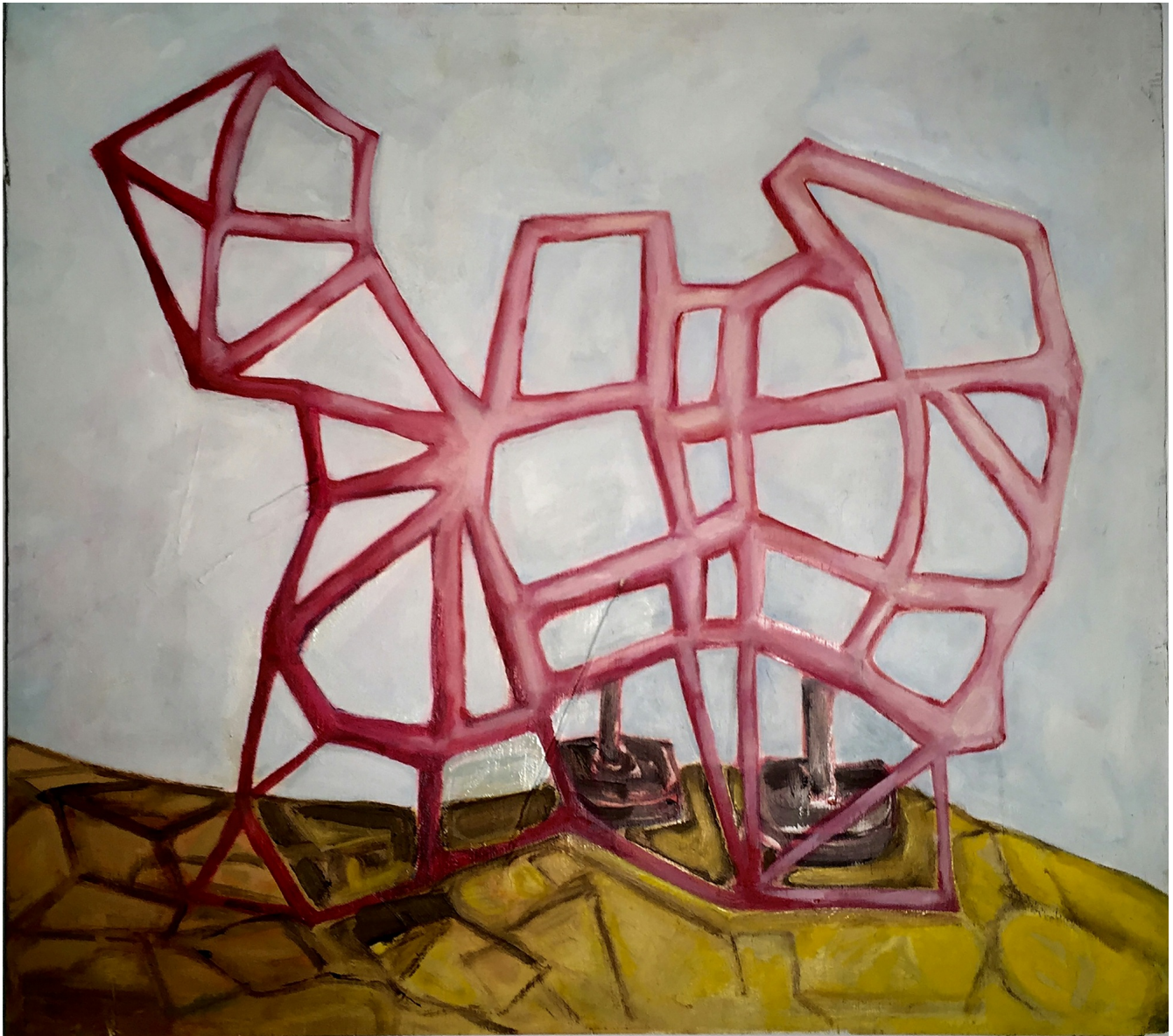
scenographic painting, Flesh, Format (from Rendering What Remains) 01 , 2017. 18x20", Oil paint on board. From Directory of Portrayals (from Rendering What Remains) , opera. Credit: © Sahra Motalebi, Courtesy of the Artist

You just can't give a fuck. That's a very helpful attitude to have had, I think. And to nurture that from the beginning, because as a woman or genderqueer person, you're going to be against a lot of odds, unless of course what you're doing is a trend, and then you can get metabolized really quickly and you become a trend; that it's own set of complications.