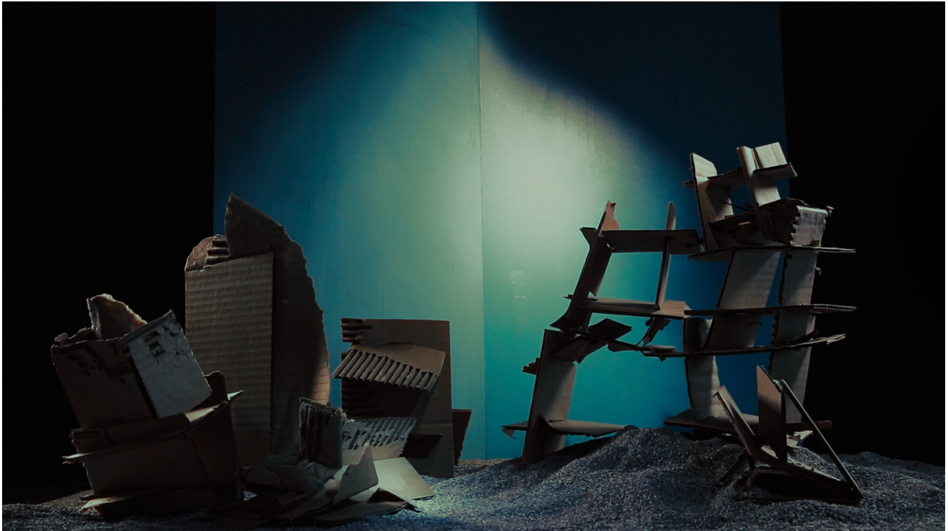
still from scenographic video, scene 4, "Sounds from Untitled Skies" 2015. Opera, 1 hour.

When you're not actively working, are you still thinking about the projects?