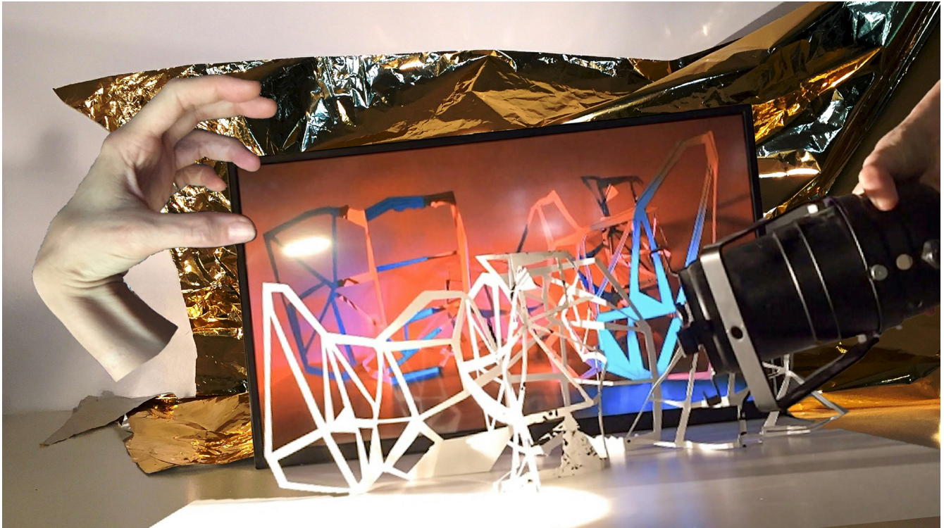
Details: production collage, Directory of Portrayals (from Rendering What Remains) 01, 2017. 25x39"

Normally, I try to fit a visual element, a textural element, and a sound and performance element into everything. Some are more successful than others. Some are better suited to one or the other of those.